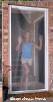
Mirage absorbs impact.