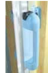
Patent pending handle exclusive to authorized Mirage Dealers.